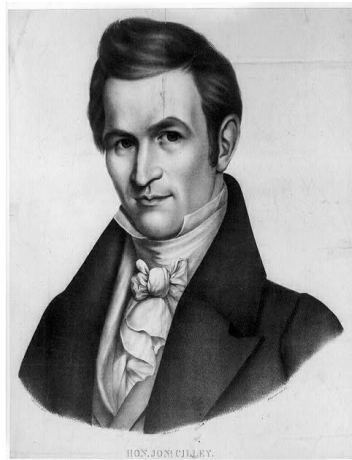
HON. JONATHAN CILLEY. Hon. Jon Cilley